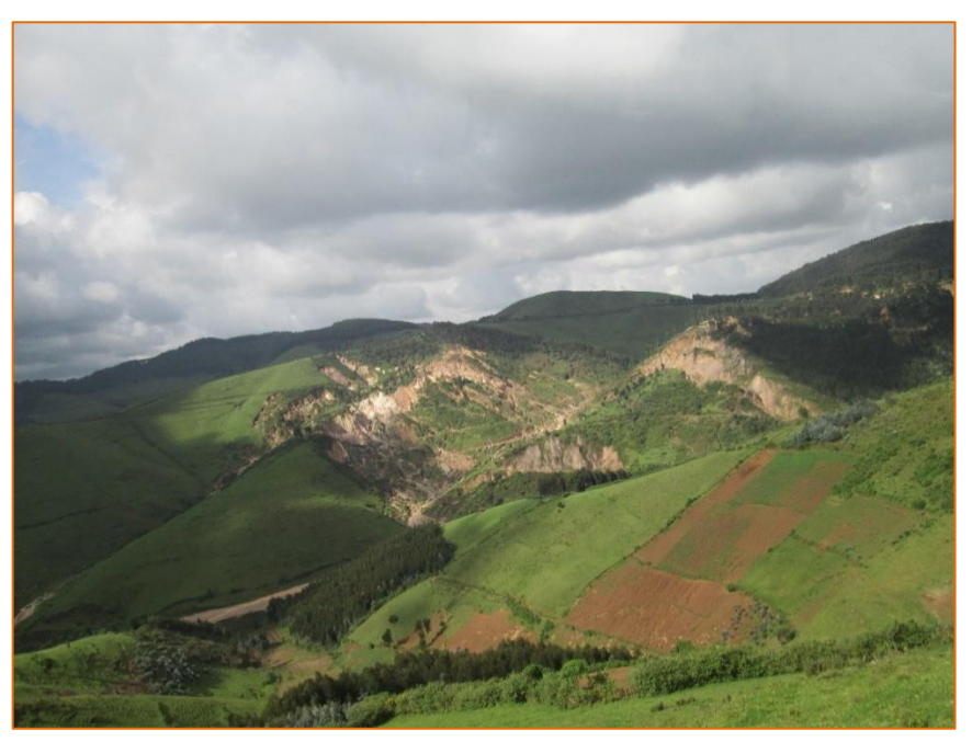
Sebeya River landscapes. Mining along and at the source of the river

Ruhwa River is located in the South Western Rwanda, at the border between Rwanda and Burundi. The entire river system constitutes Ruhwa Catchment covering an area of 612 km². The rivers flowing into Ruhwa River cross different landscapes, including two protected areas (Nyungwe and Kibira National Parks) and degraded agricultural habitats.