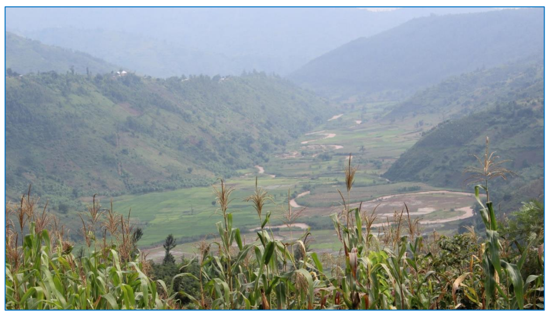
Ruhwa River at the boundary between Rwanda and Burundi